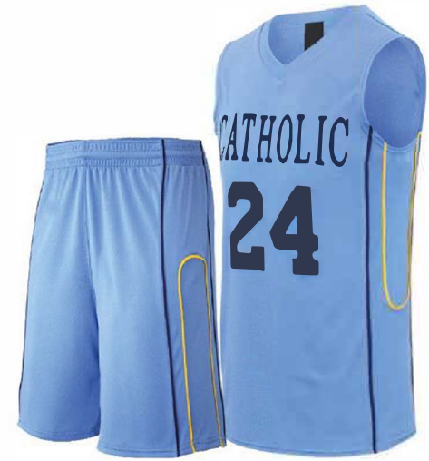
Basketball Uniform FC- 112

Custom-made basketball uniform for men 100% Polyester, 160-200gsm. Breathable and quick dry fabric with the function of moisture management and perspiration. Full Sublimation Printi L, XL, S, M