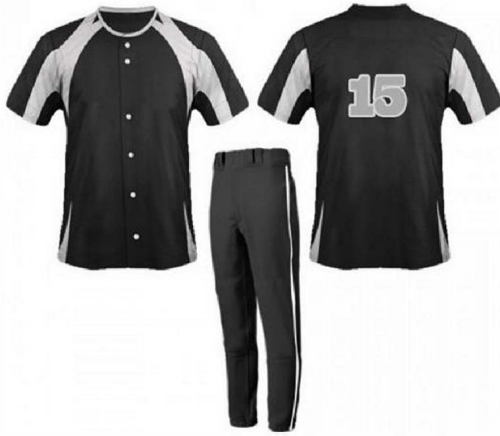
Baseball Uniform FC- 125

Custom-made baseball uniform for men 100% polyester 260gsm Double Knitted Interlock Fabric. Quick dry fabric with the function of moisture management and perspiration. Logos, numbers, artwork, pl L, XL, S, M