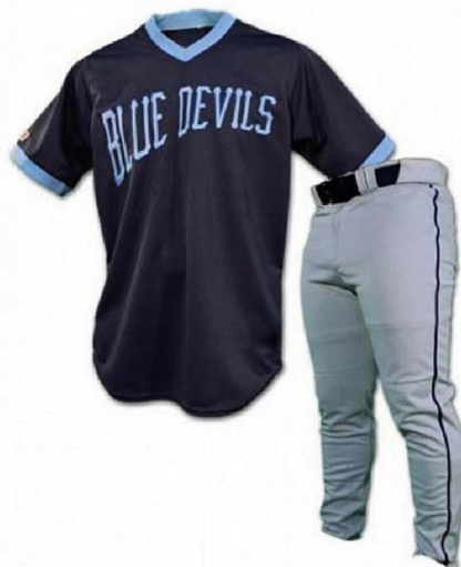
Baseball Uniform FC- 129

Custom-made baseball uniform for men 100% polyester 260gsm Double Knitted Interlock Fabric. Quick dry fabric with the function of moisture management and perspiration. Logos, numbers, artwork, pl S, L, M, XL