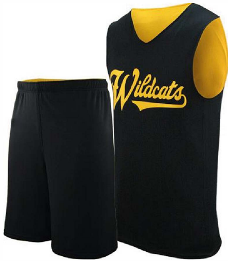
Basketball Uniform FC- 110

Custom-made basketball uniform for men 100% Polyester, 160-200gsm. Breathable and quick dry fabric with the function of moisture management and perspiration. Full Sublimation Printi L, XL, M, S