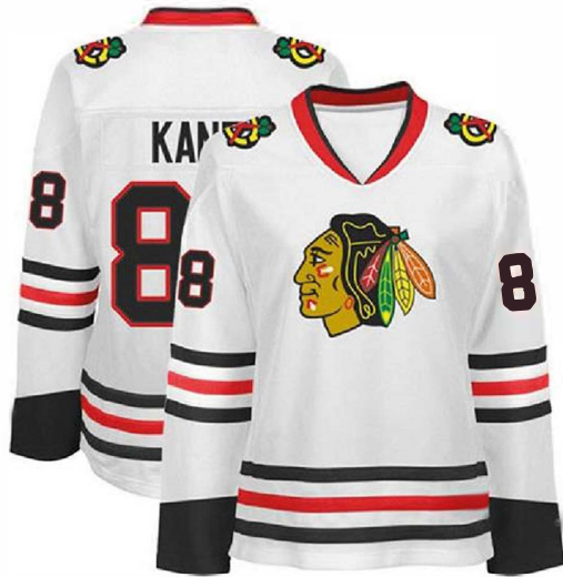
Ice Hockey Jersey FC-151

Custom-made ice hockey jersey 100% polyester, 180gsm-220gsm, quick dry function and breathable. Dye sublimation printing, silk screen printing, heat-transfer and embroidery of the artwork on Jersey S, XL, L, M