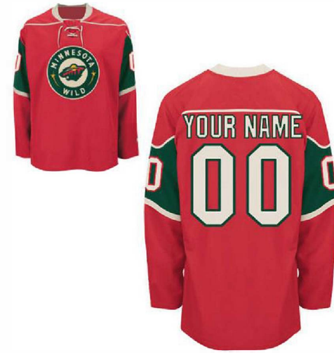
Ice Hockey Jersey

Custom-made ice hockey jersey 100% polyester, 180gsm-220gsm, quick dry function and breathable. Dye sublimation printing, silk screen printing, heat-transfer and embroidery of the artwork on Jersey XL, S, M, L