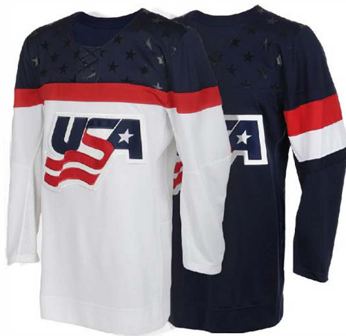
Ice Hockey Jersey

Custom-made ice hockey jersey 100% polyester, 180gsm-220gsm, quick dry function and breathable. Dye sublimation printing, silk screen printing, heat-transfer and embroidery of the artwork on Jersey S, XL, L, M