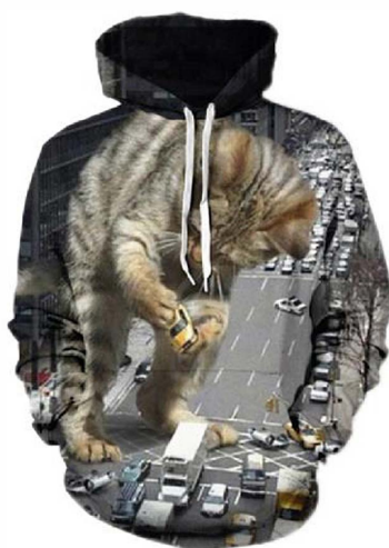
Sublimated Fleece Hoodie

Pockets: With 2 Kangaroo pockets on front XL, S, M, L