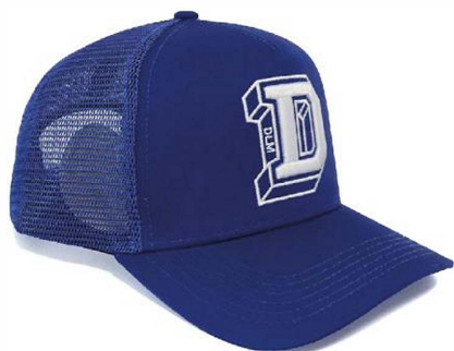
Trucker Cap Hat

5 Panel Adult Basketball Hat made of 100% Cotton with Sublimation, Embroidery, & DTF printing with Custom team Logos with standard 58cm or Custom size & adjustable back strap