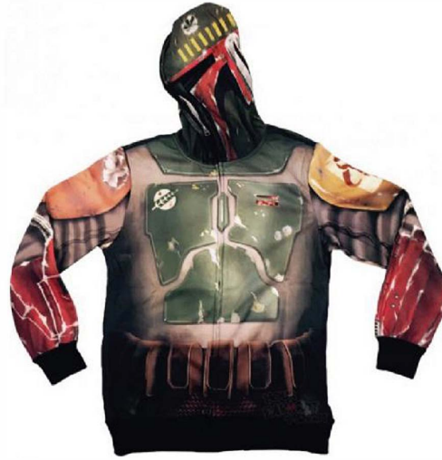
Sublimated Fleece Hoodie

Style: With full front zipper & without zipper also XL, S, M, L