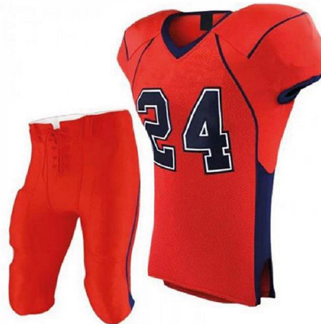
American Football Uniform FC-143

High quality american football uniform, 100% polyester made of 4 way stretch fabric with polyester lycra, spandex fabric. American football jersey double layer dazzle on the shoulder 350 GSM compr M, L, XL, S