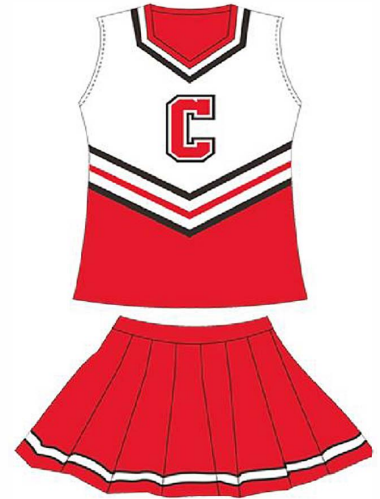
Cheer Leading Uniform FC - 207

Cheer Leading Uniform made of 100%Polyester and Custom Sublimation Women Skirts Suit Dresses with Custom Logos XS, S, M, L, XL-4XL Or Customized Sizes & Colors