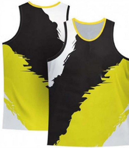
Sublimation Tank Top FC-200

100% polyester Sublimation Tank Top L, M, S, XL