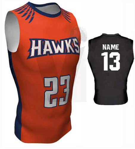
Flag Football Uniform

Flag Football Uniform made of 100%Polyester and Custom This uniform is made from hard wearing poly material with Customized Design Silk printing , Sublimation, Embroidery with high ribbed collar, with all sizez and colors