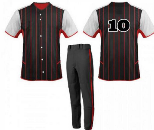
Baseball Uniform FC- 130

Custom-made baseball uniform for men 100% polyester 260gsm Double Knitted Interlock Fabric. Quick dry fabric with the function of moisture management and perspiration. Logos, numbers, artwork, pl S, L, M, XL