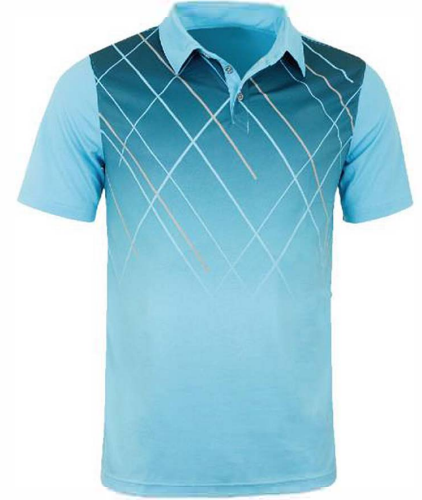
Sublimation Polo Shirt FC- 183

Sublimated Polo Shirts Made of Polyester Material:100% Polyester (Dull speedo, Shine speedo, Mini jacquard, Dobby Jacquard etc.) Fabric Weight: 140-160 gsm Sleeves: Short & Long sleeves (B L, M, S, XL