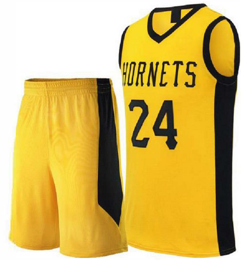
Basketball Uniform FC-118

Custom-made basketball uniform for men 100% Polyester, 160-200gsm. Breathable and quick dry fabric with the function of moisture management and perspiration. Full Sublimation Printi M, S, XL, L