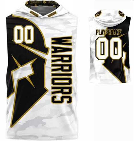
Flag Football Uniform FC- 180

Flag Football Uniform made of 100%Polyester and Custom This uniform is made from hard wearing poly material with Customized Design Silk printing , Sublimation, Embroidery with high ribbed collar, with all size and colors