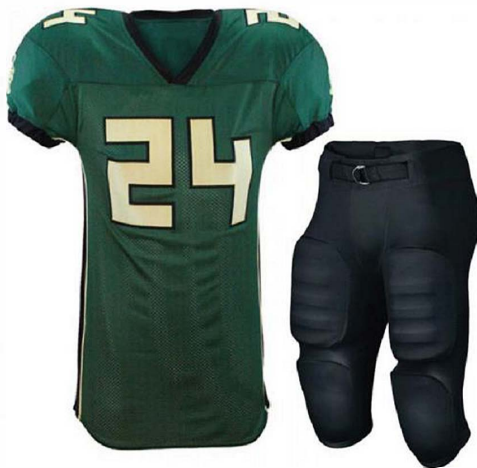
American Football Uniform FC-142

High quality american football uniform, 100% polyester made of 4 way stretch fabric with polyester lycra, spandex fabric. American football jersey double layer dazzle on the shoulder 350 GSM compr S, XL, L, M