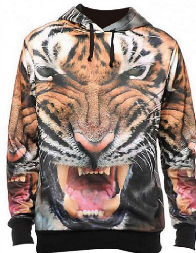
Sublimated Fleece Hoodie

Pockets: With 2 Kangaroo pockets on front L, M, S, XL