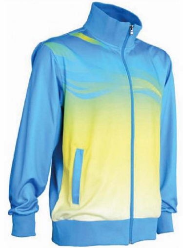
Sublimated Fleece Hoodie

Style: With full front zipper & without zipper also XL, S, M, L