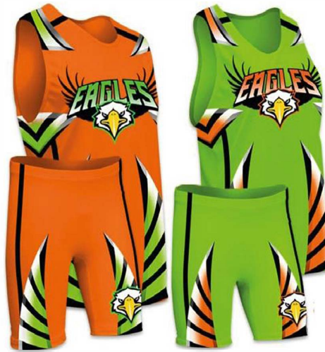
Flag Football Uniform

Flag Football Uniform made of 100%Polyester and Custom This uniform is made from hard wearing poly material with Customized Design Silk printing , Sublimation, Embroidery with high ribbed collar, with all sizez and colors