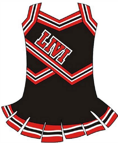
Cheer Leading Uniform FC - 208

Cheer Leading Uniform made of 100%Polyester and Custom Sublimation Women Skirts Suit Dresses with Custom Logos XS, S, M, L, XL-4XL Or Customized Sizes & Colors