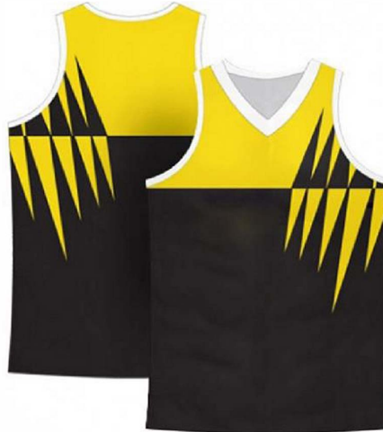
Sublimation Tank Top FC-203

100% polyester Sublimation Tank Top XL, S, M, L