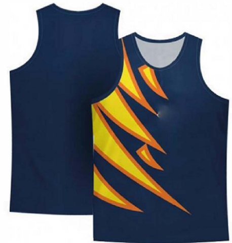
Sublimation Tank Top FC-204

100% polyester Sublimation Tank Top XL, S, M, L