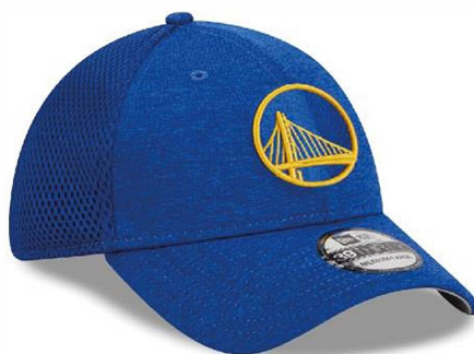
Flex Cap Hat

5 Panel Adult Baseball Hat made of 100% Cotton with Sublimation, Embroidery, & DTF printing with Custom team Logos with standard 58cm or Custom size & adjustable back strap