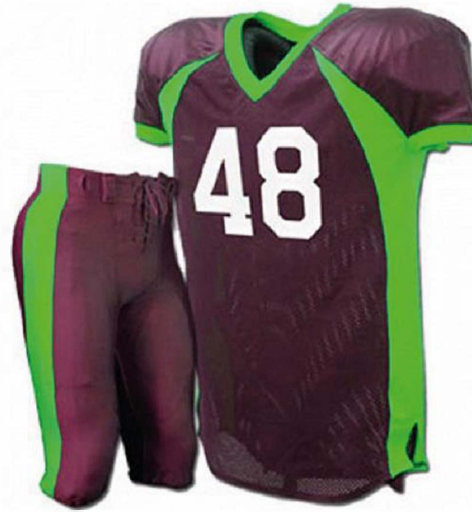
American Football Uniform FC-140

High quality american football uniform, 100% polyester made of 4 way stretch fabric with polyester lycra, spandex fabric. American football jersey double layer dazzle on the shoulder 350 GSM compr S, XL, M, L