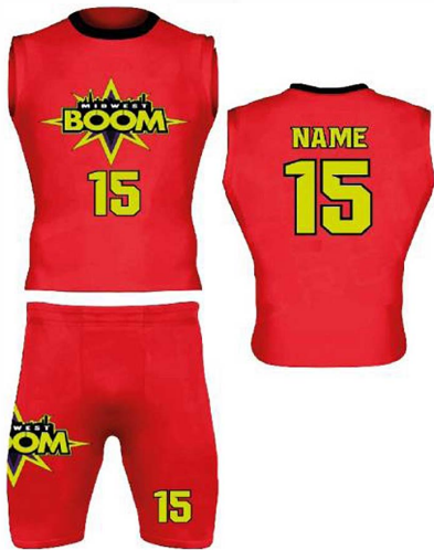
Flag Football Uniform

Flag Football Uniform made of 100%Polyester and Custom This uniform is made from hard wearing poly material with Customized Design Silk printing , Sublimation, Embroidery with high ribbed collar, with all sizez and colors