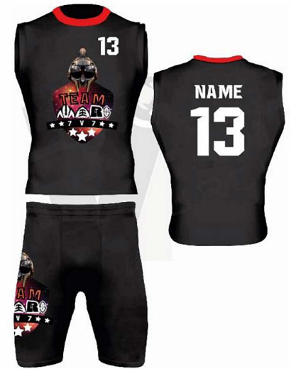
Flag Football Uniform

Flag Football Uniform made of 100%Polyester and Custom This uniform is made from hard wearing poly material with Customized Design Silk printing , Sublimation, Embroidery with high ribbed collar, with all sizez and colors