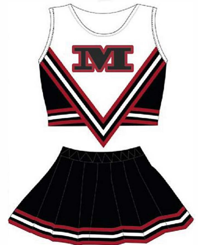
Cheer Leading Uniform FC - 210

Cheer Leading Uniform made of 100%Polyester and Custom Sublimation Women Skirts Suit Dresses with Custom Logos XS, S, M, L, XL-4XL Or Customized Sizes & Colors