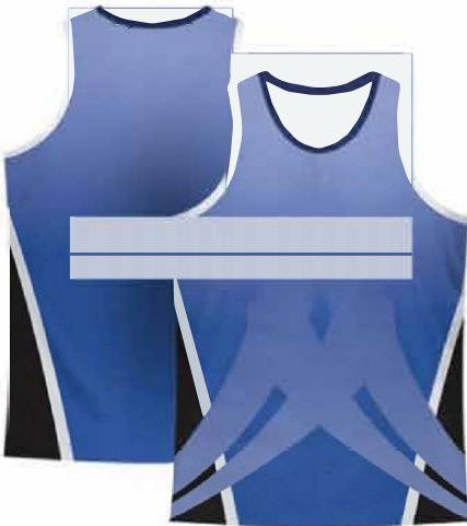
Sublimation Tank Top FC-202

100% polyester Sublimation Tank Top XL, S, M, L