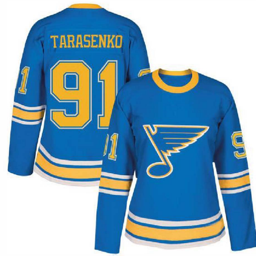
Ice Hockey Jersey FC-153

Custom-made ice hockey jersey 100% polyester, 180gsm-220gsm, quick dry function and breathable. Dye sublimation printing, silk screen printing, heat-transfer and embroidery of the artwork on Jersey M, L, XL, S