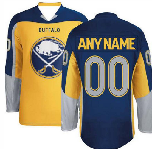
Ice Hockey Jersey

Custom-made ice hockey jersey 100% polyester, 180gsm-220gsm, quick dry function and breathable. Dye sublimation printing, silk screen printing, heat-transfer and embroidery of the artwork on Jersey XL, S, M, L