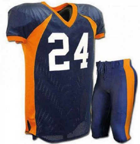
American Football Uniform FC-141

High quality american football uniform, 100% polyester made of 4 way stretch fabric with polyester lycra, spandex fabric. American football jersey double layer dazzle on the shoulder 350 GSM compr S, XL, L, M