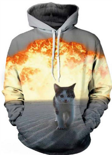
Sublimated Fleece Hoodie

Pockets: With 2 Kangaroo pockets on front L, M, S, XL