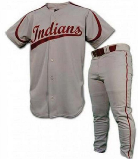
Baseball Uniform FC- 127

Custom-made baseball uniform for men 100% polyester 260gsm Double Knitted Interlock Fabric. Quick dry fabric with the function of moisture management and perspiration. Logos, numbers, artwork, pl S, XL, M, L