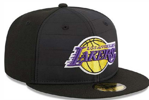
Basketball Cap Hat

5 Panel Adult Flex Hat made of 100% Cotton with Sublimation, Embroidery, & DTF printing with Custom team Logos with standard 58cm or Custom size & adjustable back strap