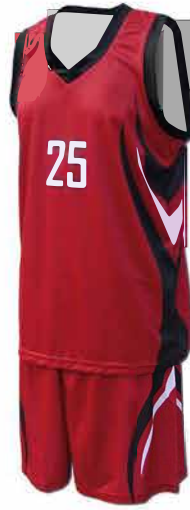
Basketball Uniform FC-117

Custom-made basketball uniform for men 100% Polyester, 160-200gsm. Breathable and quick dry fabric with the function of moisture management and perspiration. Full Sublimation Printi L, XL, S, M