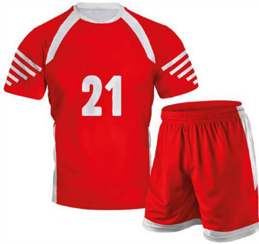
Volleyball Uniform FC- 169

Volleyball Men Uniform 100% polyester. Available in Any size and any color. XL, S, M, L