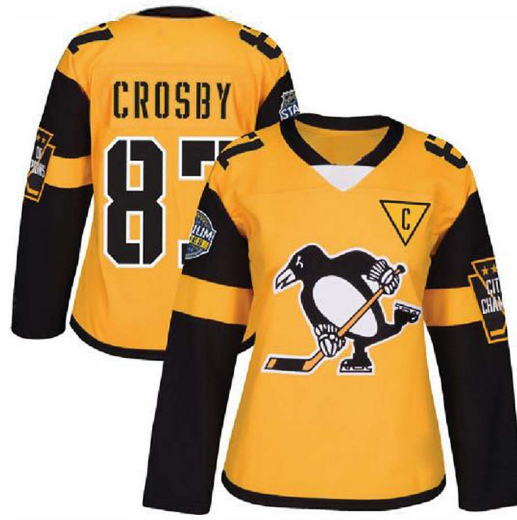
Ice Hockey Jersey FC-152

Custom-made ice hockey jersey 100% polyester, 180gsm-220gsm, quick dry function and breathable. Dye sublimation printing, silk screen printing, heat-transfer and embroidery of the artwork on Jersey S, XL, L, M