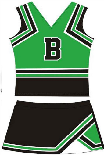
Cheer Leading Uniform FC - 205

Cheer Leading Uniform made of 100%Polyester and Custom Sublimation Women Skirts Suit Dresses with Custom Logos XS, S, M, L, XL-4XL Or Customized Sizes & Colors