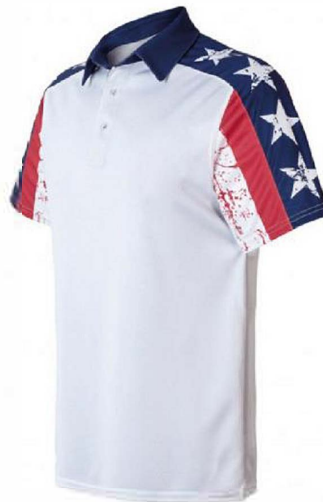
Sublimation Polo Shirt FC- 185

Sublimated Polo Shirts Made of Polyester Material:100% Polyester (Dull speedo, Shine speedo, Mini jacquard, Dobby Jacquard etc.) Fabric Weight: 140-160 gsm Sleeves: Short & Long sleeves (B L, M, S, XL