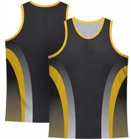
Sublimation Tank Top FC-201

100% polyester Sublimation Tank Top XL, S, M, L