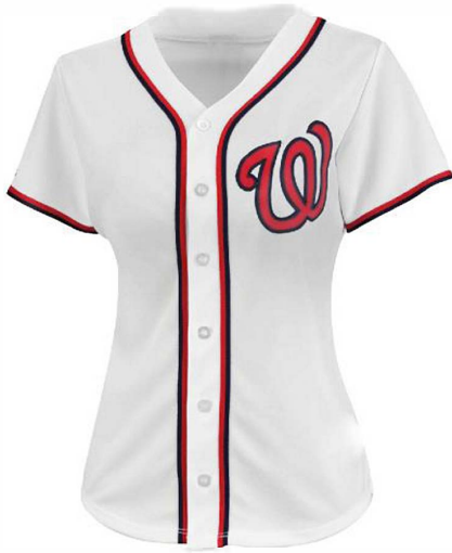
Baseball Shirt FC- 136

Custom-made baseball shirt for women 100% polyester 260gsm Double Knitted Interlock Fabric. Quick dry fabric with the function of moisture management and perspiration. Logos, numbers, artwork, pl S, L, XL, M