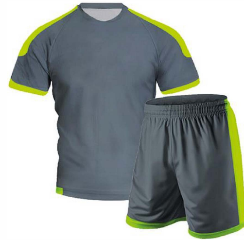
Volleyball Uniform FC- 171

Volleyball Men Uniform 100% polyester. Available in Any size and any color. XL, S, M, L