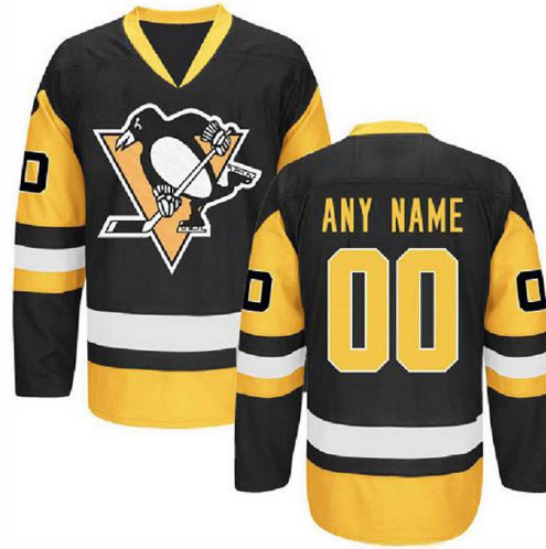
Ice Hockey Jersey

Custom-made ice hockey jersey 100% polyester, 180gsm-220gsm, quick dry function and breathable. Dye sublimation printing, silk screen printing, heat-transfer and embroidery of the artwork on Jersey S, XL, L, M