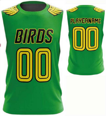
Flag Football Uniform FC- 178

Flag Football Uniform made of 100%Polyester and Custom This uniform is made from hard wearing poly material with Customized Design Silk printing , Sublimation, Embroidery with high ribbed collar, with all size and colors