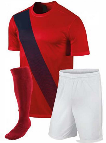
Soccer Uniform FC- 109

Material: Soccer Uniform 100% Polyester Dri Fit. Printing: Sublimated Soccer Uniform , Cut & Sew Available in different colors, sizes M, XL, L, S