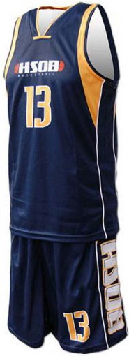
Basketball Uniform FC-116

Custom-made basketball uniform for men 100% Polyester, 160-200gsm. Breathable and quick dry fabric with the function of moisture management and perspiration. Full Sublimation Printi L, XL, S, M