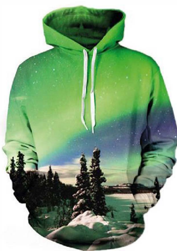
Sublimated Fleece Hoodie

Pockets: With 2 Kangaroo pockets on front L, M, S, XL