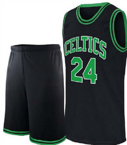
Basketball Uniform FC- 114

Custom-made basketball uniform for men 100% Polyester, 160-200gsm. Breathable and quick dry fabric with the function of moisture management and perspiration. Full Sublimation Printi L, XL, S, M