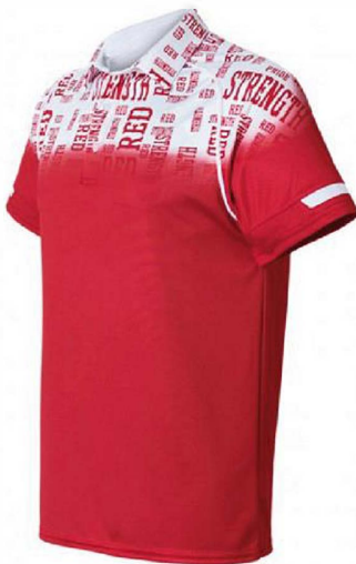
Sublimation Polo Shirt FC- 184

Sublimation Polo Shirt is a bold frontal patterning with performance fabric engineering Dry lite fabric engineering Moisture management Soft, stretchable material Bold frontal patterning L, M, S, XL