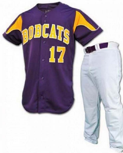
Baseball Uniform FC- 126

Custom-made baseball uniform for men 100% polyester 260gsm Double Knitted Interlock Fabric. Quick dry fabric with the function of moisture management and perspiration. Logos, numbers, artwork, pl L, XL, S, M