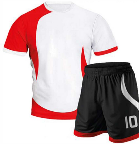
Volleyball Uniform FC- 170

Volleyball Men Uniform 100% polyester. Available in Any size and any color. XL, S, M, L