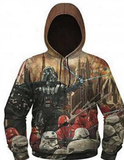
Sublimated Fleece Hoodie

Pockets: With 2 Kangaroo pockets on front L, M, S, XL