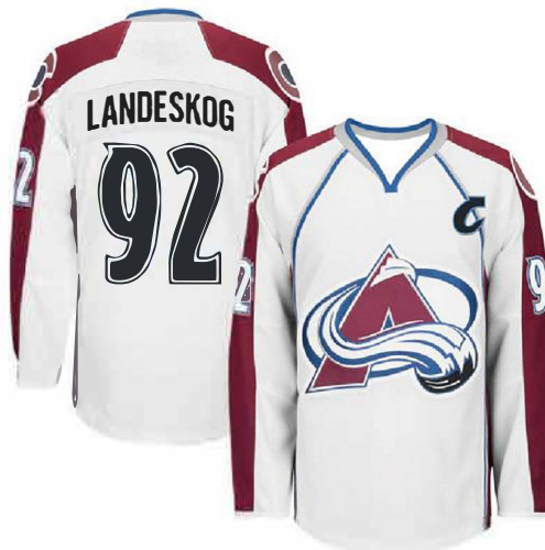
Ice Hockey Jersey

Custom-made ice hockey jersey 100% polyester, 180gsm-220gsm, quick dry function and breathable. Dye sublimation printing, silk screen printing, heat-transfer and embroidery of the artwork on Jersey M, L, XL, S