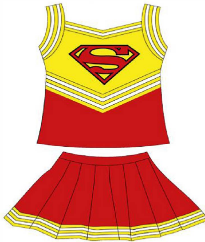
Cheer Leading Uniform FC - 209

Cheer Leading Uniform made of 100%Polyester and Custom Sublimation Women Skirts Suit Dresses with Custom Logos XS, S, M, L, XL-4XL Or Customized Sizes & Colors