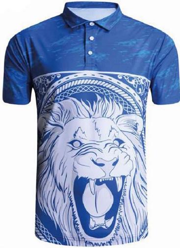
Sublimation Polo Shirt FC- 181

Our custom sublimated polo are made with high-quality polyester materials and can feature any design you want. Whether you prefer something fully sublimated or a simple logo, we will work with you XL, S, M, L