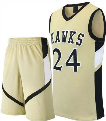
Basketball Uniform FC- 113

Custom-made basketball uniform for men 100% Polyester, 160-200gsm. Breathable and quick dry fabric with the function of moisture management and perspiration. Full Sublimation Printi M, S, XL, L