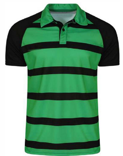
Sublimation Polo Shirt FC- 186

Sublimated Polo Shirts Made of Polyester Material:100% Polyester (Dull speedo, Shine speedo, Mini jacquard, Dobby Jacquard etc.) Fabric Weight: 140-160 gsm Sleeves: Short & Long sleeves (B L, M, S, XL