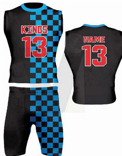
Flag Football Uniform

Flag Football Uniform made of 100%Polyester and Custom This uniform is made from hard wearing poly material with Customized Design Silk printing , Sublimation, Embroidery with high ribbed collar, with all sizez and colors