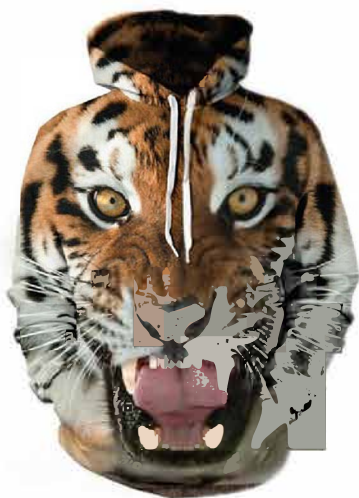
Sublimated Fleece Hoodie