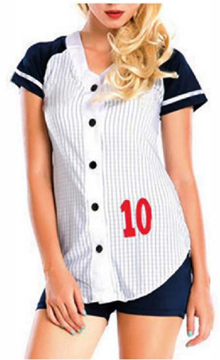
Baseball Shirt FC- 138

Custom-made baseball shirt for women 100% polyester 260gsm Double Knitted Interlock Fabric. Quick dry fabric with the function of moisture management and perspiration. Logos, numbers, artwork, pl M, XL, L, S