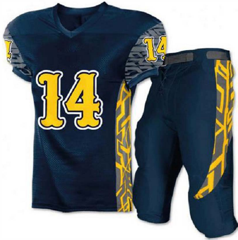
American Football Uniform FC-139

High quality american football uniform, 100% polyester made of 4 way stretch fabric with polyester lycra, spandex fabric. American football jersey double layer dazzle on the shoulder 350 GSM compr S, XL, M, L