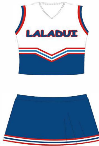
Cheer Leading Uniform FC - 206

Cheer Leading Uniform made of 100%Polyester and Custom Sublimation Women Skirts Suit Dresses with Custom Logos XS, S, M, L, XL-4XL Or Customized Sizes & Colors