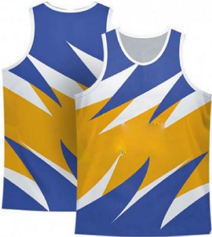
Sublimation Tank Top

100% polyester Sublimation Tank Top L, M, S, XL