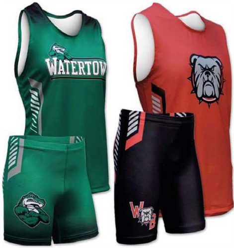
Flag Football Uniform