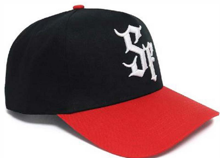
Baseball Cap Hat