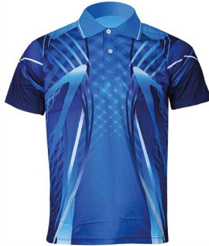
Sublimation Polo Shirt FC- 182

Our custom sublimated polo are made with high-quality polyester materials and can feature any design you want. Whether you prefer something fully sublimated or a simple logo, we will work with you XL, S, M, L