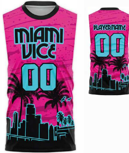
Flag Football Uniform FC- 179

Flag Football Uniform made of 100%Polyester and Custom This uniform is made from hard wearing poly material with Customized Design Silk printing , Sublimation, Embroidery with high ribbed collar, with all size and colors