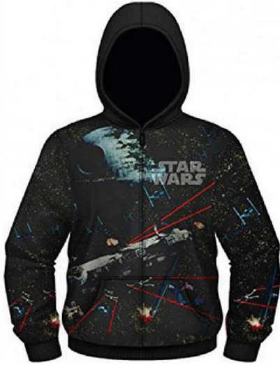
Sublimated Fleece Hoodie