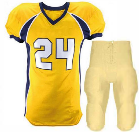
American Football Uniform FC-144

High quality american football uniform, 100% polyester made of 4 way stretch fabric with polyester lycra, spandex fabric. American football jersey double layer dazzle on the shoulder 350 GSM compr XL, S, M, L