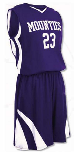
Basketball Uniform FC- 115

Custom-made basketball uniform for men 100% Polyester, 160-200gsm. Breathable and quick dry fabric with the function of moisture management and perspiration. Full Sublimation Printi M, S, XL, L