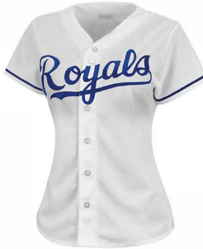
Baseball Shirt FC- 137

Custom-made baseball shirt for women 100% polyester 260gsm Double Knitted Interlock Fabric. Quick dry fabric with the function of moisture management and perspiration. Logos, numbers, artwork, pl S, L, XL, M