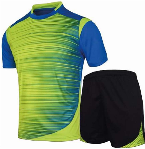
Soccer Uniform FC- 107

Material: Soccer Uniform 100% Polyester Dri Fit. Printing: Sublimated Soccer Uniform , Cut & Sew Available in different colors, sizes L, XL, M, S