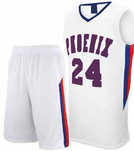
Basketball Uniform FC- 111

Custom-made basketball uniform for men 100% Polyester, 160-200gsm. Breathable and quick dry fabric with the function of moisture management and perspiration. Full Sublimation Printi L, XL, M, S