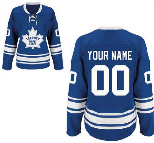
Ice Hockey Jersey