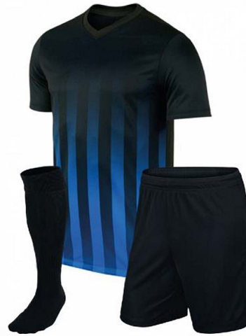
Soccer Uniform FC- 108

Material: Soccer Uniform 100% Polyester Dri Fit. Printing: Sublimated Soccer Uniform , Cut & Sew Available in different colors, sizes L, XL, M, S