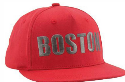
Snapback Baseball Cap

Bucket Outdoor mountaineering sun protection made of 100% Cotton Sublimation, Embroidery, & DTF printing with Custom team Logos with standard or Custom size & adjustable strap