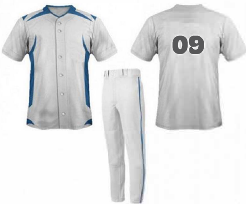
Baseball Uniform FC- 128

Custom-made baseball uniform for men 100% polyester 260gsm Double Knitted Interlock Fabric. Quick dry fabric with the function of moisture management and perspiration. Logos, numbers, artwork, pl S, XL, M, L